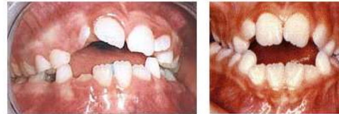
malocclusion / overbite damage from thumb sucking