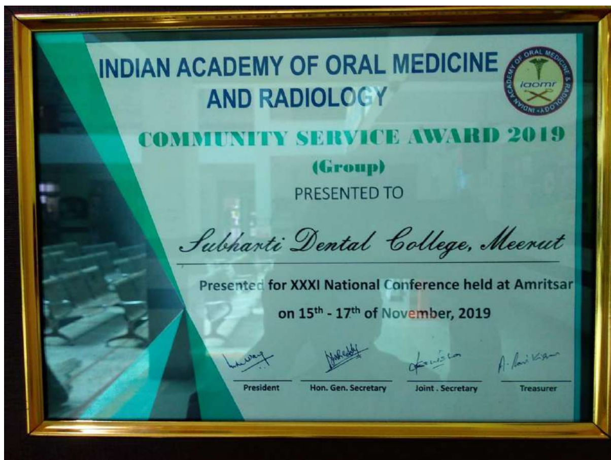
AWARD FROM IAOMR FOR BEST TOBACCO CESSATION ACTIVITIES AND COMMUNITY SERVICE 2019