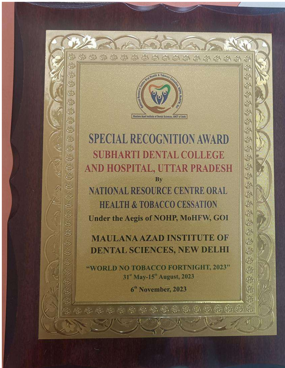
Award of Special Recognition by MoHFW in World No Tobacco Day 2023 fortnight campaign