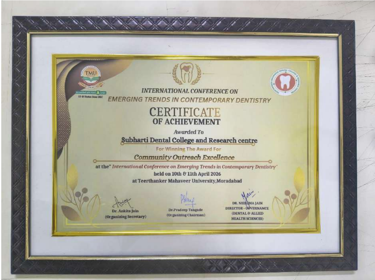
Community Outreach Excellence Award in International conference of Emerging Trends in Contemporary Dentistry in 2026